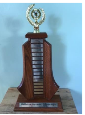
NSW Champion region (replacement)