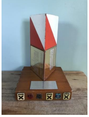
NSW Champion School